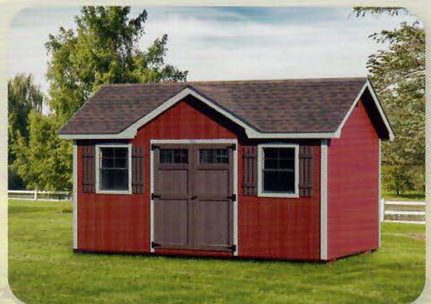
10' x 16' Red Walls Clay Trim Hickory Roof Shown with Optional Windows Shutters Brown Transom Doors 8' Gable Dormer

Overall Height 8' w = 10'2" h 10' w = 10'9" h 12' w = 11'4" h 14' w = 11'11" h 6'6" Sidewalls