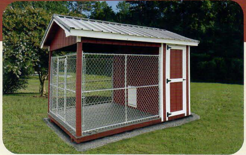
8' x 12' Single Red Walls, White Trim, Black Metal Roof