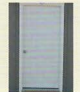
Prehung 6 Panel