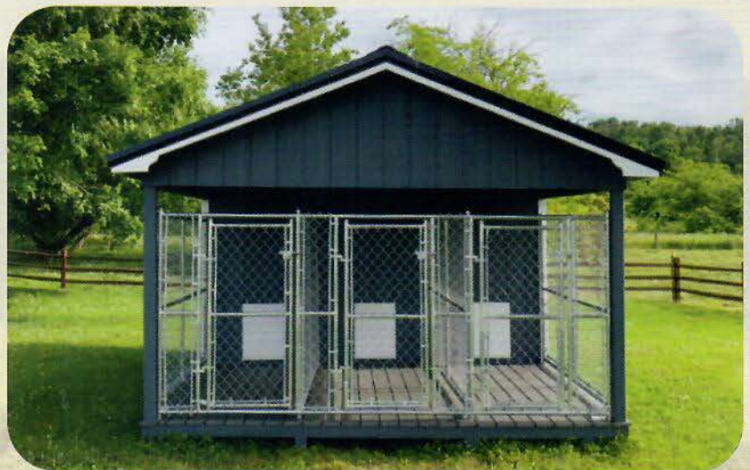
12' x 14' Triple Avocado Walls, White Trim, Black Metal Roof