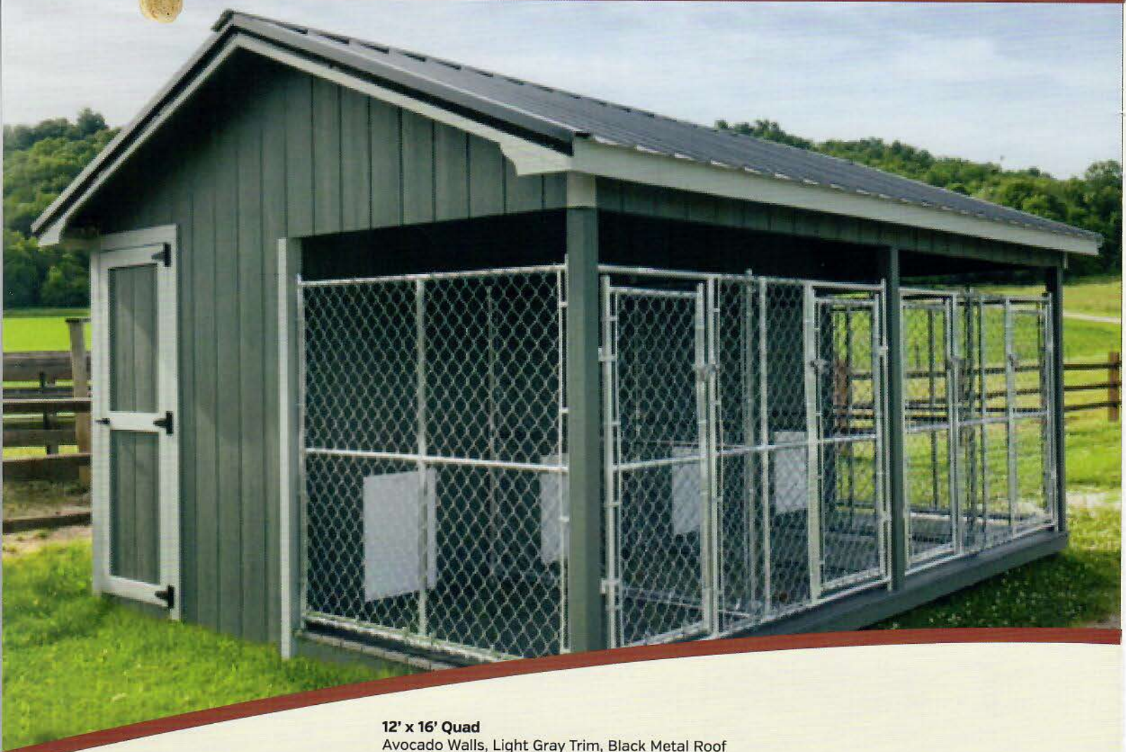
12' x 16' Quad Avocado Walls, Light Gray Trim, Black Metal Roof