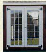
Composite Full View