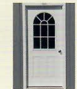
Prehung 11 Lite Composite