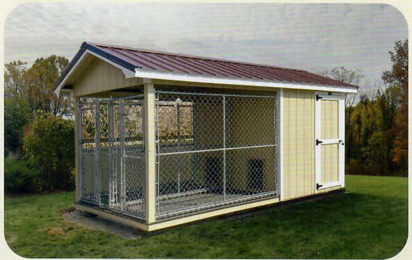
8' x 14' Double Beige Walls, White Trim, Bronze Metal Roof

Quad kennel can be added to in 4' increments. Add $2,000 per 4' pen.