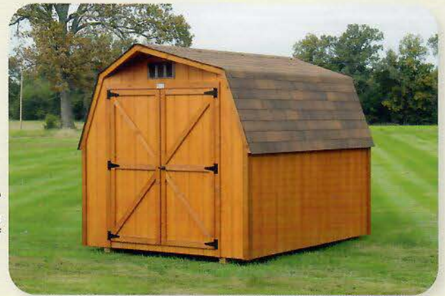
8' x 12' Bark Stain Cedar Roof