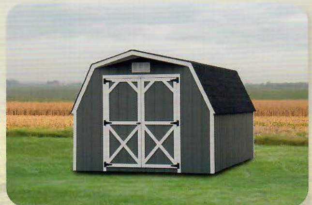
10' x 14' Avocado Walls White Trim Charcoal Roof