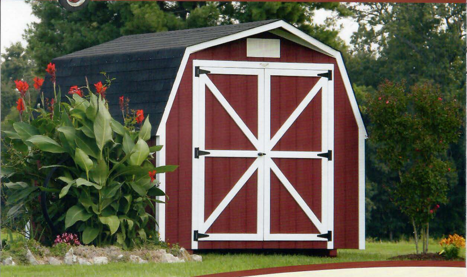
8' x 12' Red Walls, White Trim, Charcoal Roof