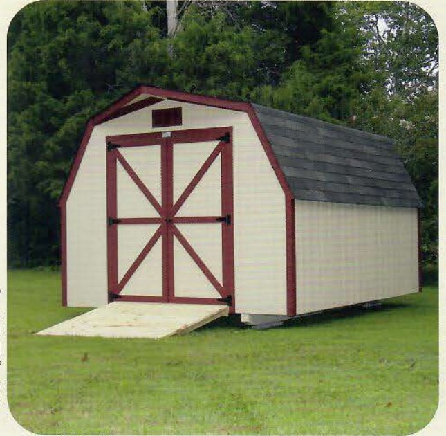
10' x 12' Beige Walls Red Trim Weathered Wood Roof Shown with Optional Ramp