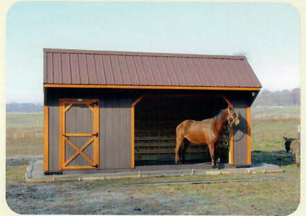
10' x 20' Brown Walls, Stained Trim, Brown Roof Shown with Tack Room on end