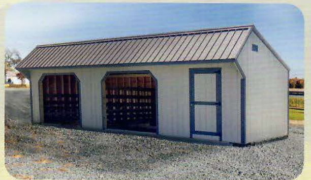
12' x 32' Light Gray Walls, Dark Gray Trim, Charcoal Roof Shown with Tack Room on end and Stall Divider