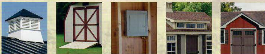
Up to 6' long