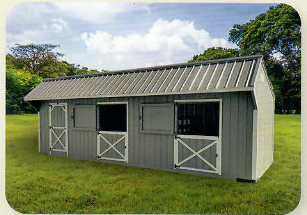
12' x 28' Clay Walls, Beige Trim, Bronze Metal Roof Shown with optional Dutch Doors and Tack room on end